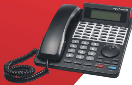
Digital Phone 8150

When it comes to advanced communication requirements it's the technological advantage that enhances efficiency and flexibility of use. The Digital Phones 8150/8180 thus becomes the preferred choice for those who are in need of updating their current communication systems. With its easy-to use Navigation Key (Jog Dial) this phone helps extension users quickly select and control various features, including commonly used settings such as microphone, speaker and ringer volume, and adjusting LED background lightness and colors. It's ergonomic design and operational function contributes to its value addition and makes it convenient to use.