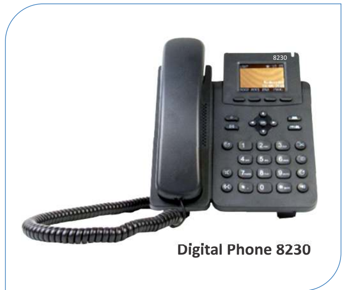
Digital Phone 8230

When it comes to advanced communication requirements it's the technological advantage that enhances efficiency and flexibility of use. The Digital Phone 8230 thus becomes the preferred choice for those who are in need of updating their current communication systems. With its easy-to use Navigation Key (Jog Dial) this phone helps extension users quickly select and control various features, including commonly used settings such as microphone, speaker and ringer volume, and adjusting LED background lightness and colors. It's ergonomic design and operational function contributes to its value addition and makes it convenient to use.