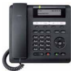
OpenScape Communication Point 200

Also with the new terminals, the customer can use the familiar scope of functionality!