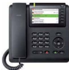
OpenScape Communication Point 600

OpenScape 4000 V8 supports the CP phone family in their SIP and HFA version. OpenScape 4000 can dynamically provide the cPxxx endpoints with the necessary SW (SIP or HFA) depending on the line configuration.