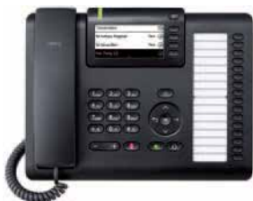
OpenScape Communication Point 400