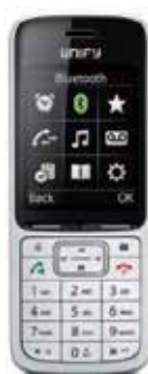
OpenScape DECT Phone SL5