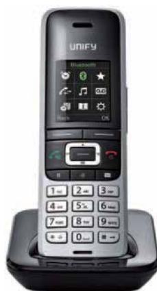
OpenScape DECT Phone S5