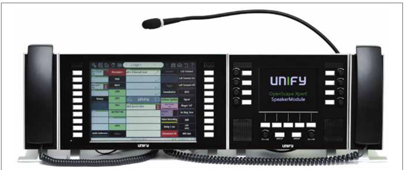
OpenStage Xpert 6010p V1 terminal

To reduce the number of moving parts and increase mean time between failures/replacement, the OpenStage Xpert device uses a compact flash card and is fanless. In addition, all of the components in the solution are compatible with VM ware and can be doubled-up for redundancy and high availability.